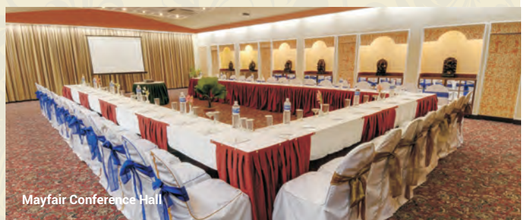
Mayfair Conference Hall