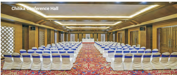
Chilika Conference Hall